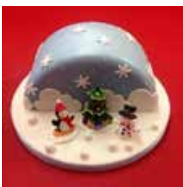
Christmas Snow Globe

Speciality Cakes in Knaphill High Street have some great ideas for Christmas Cakes like these