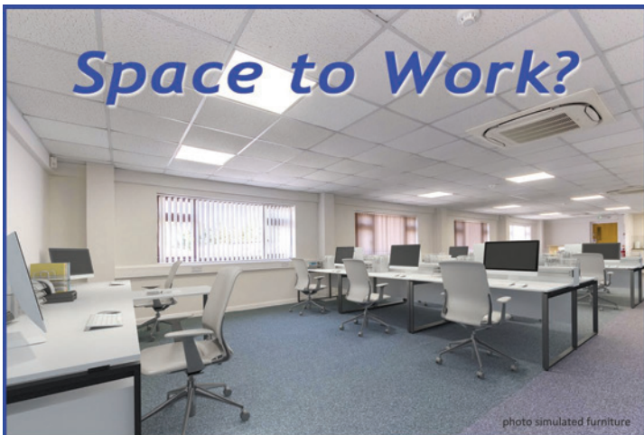
photo simulated furniture