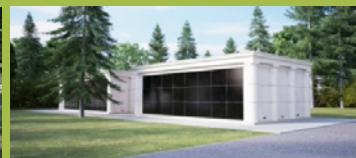
Brookwood Cemetery Glades House, Cemetery Pales, Brookwood Woking, Surrey GU24 0BL

01483 472222 | info@brookwoodcemetery.com | www.brookwoodcemetery.com