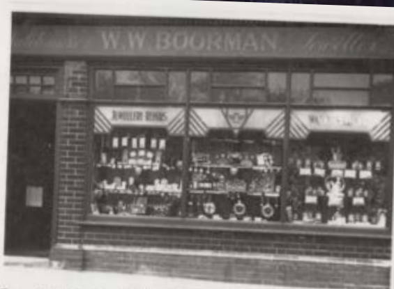
The original shop. 1939. The business was started in 1930. It's address was 28, High St, and it now forms part of the foundations of the Co-operative store!