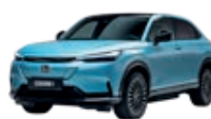
Honda e:Ny1 - e:BEV

TRIDENT HONDA PROUDLY PRESENTS THE LATEST HONDA SUV RANGE