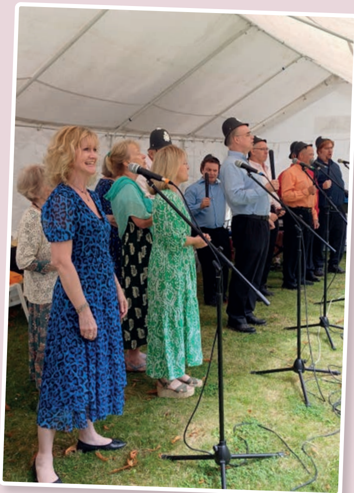
KASJOG performed at the Knaphill Village Show on July 20, 2024

My Fair Lady is a more contemporary show for KASJOG and performances will be popular, so buy your ticket now! Tickets are available from www.ticketsource.co.uk/kasjog or by calling 0333 666 3366.